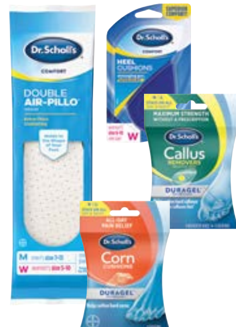
All Dr. Scholl's Products in Stock