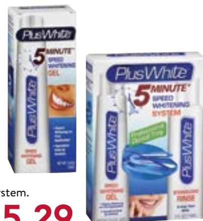
Plus White Speed Whitening 2 ounce Gel or Complete System.