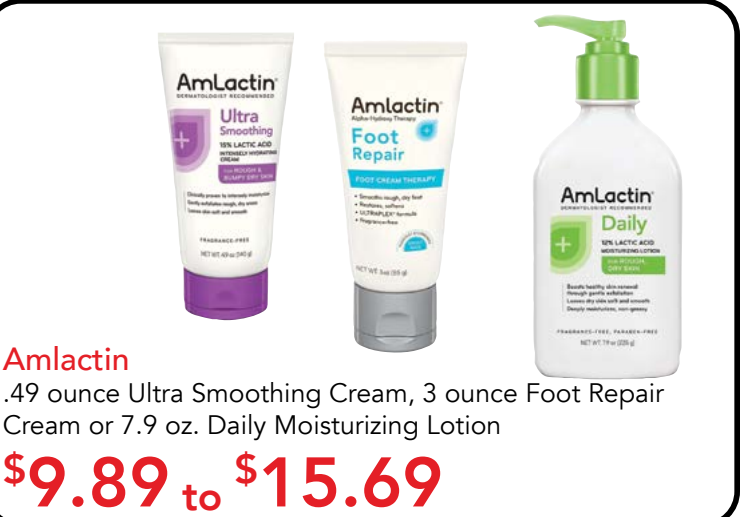
Amlactin .49 ounce Ultra Smoothing Cream, 3 ounce Foot Repair Cream or 7.9 oz. Daily Moisturizing Lotion