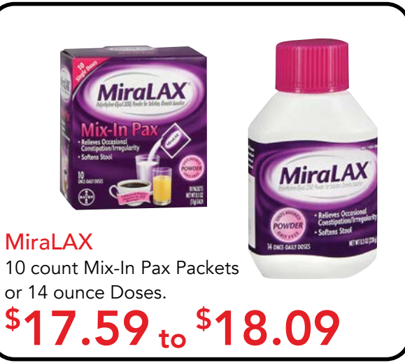
MiraLAX 10 count Mix-In Pax Packets or 14 ounce Doses.