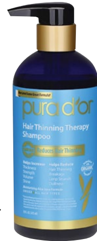
Pura d'or Hair Care 16 to 18 ounce. Assorted shampoos or conditioners.