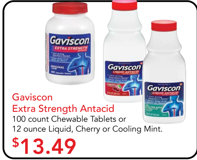
Gaviscon Extra Strength Antacid 100 count Chewable Tablets or 12 ounce Liquid, Cherry or Cooling Mint.