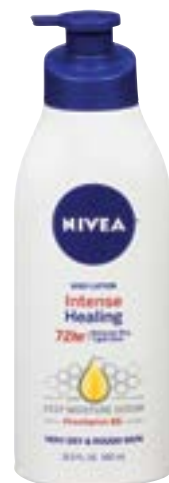
Nivea Intense Healing Body Lotion 16.9 ounce.