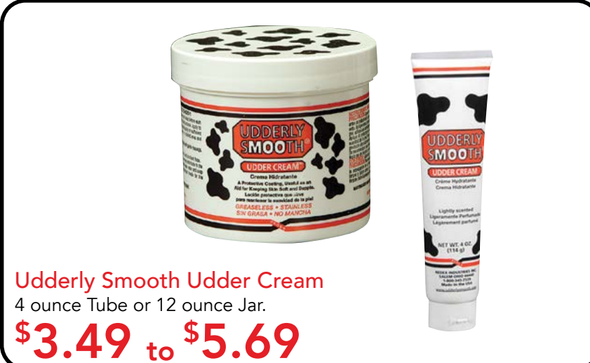
Udderly Smooth Udder Cream 4 ounce Tube or 12 ounce Jar.