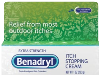
Benadryl .47 to 2 ounce Assorted itch stopping cream, stick or cooling spray.