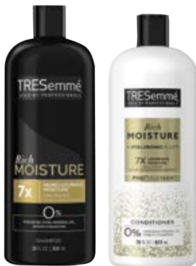
TRESemmé 28 ounce Shampoo or conditioner.