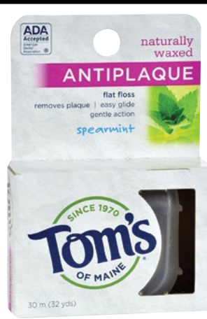
Tom's of Maine Antiplaque Floss 32 yards Naturally waxed.