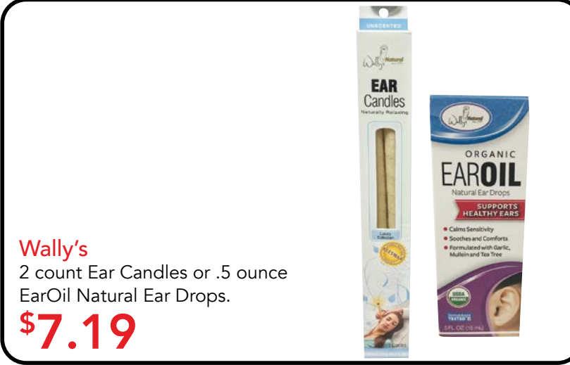
Wally's 2 count Ear Candles or .5 ounce EarOil Natural Ear Drops.