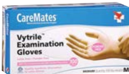
CareMates Vytrile Examination Gloves 100 count. Medium.