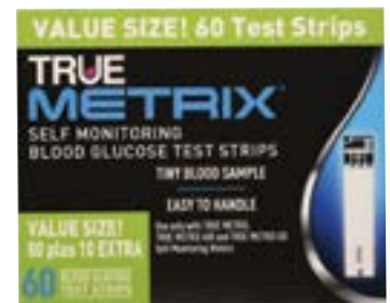
True Metrix Self Monitoring Blood Glucose Test Strips 30 to 60 count.