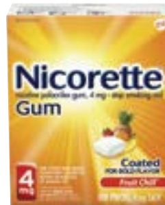
Stop Smoking Aids 14 to 100 count. Assorted NicoDerm CQ patches, Nicorette gum or lozenges.