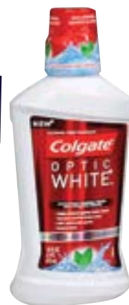
Colgate 6.4 ounce Cavity Protection Toothpaste or 16 ounce Optic White Mouthwash.