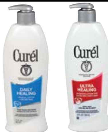
Curél Lotion 13 ounce Daily or Ultra Healing.