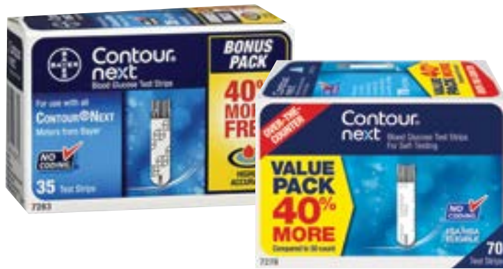
Contour next Blood Glucose Test Strips 35 to 70 count.