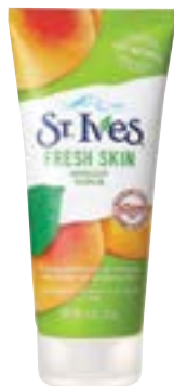
St. Ives Fresh Skin Apricot Scrub 6 ounce.