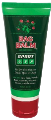
Bag Balm Sport 2 ounce Skin moisturizer.