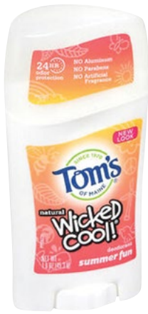
Tom's of Maine Wicked Cool Deodorant 1.5 ounce.