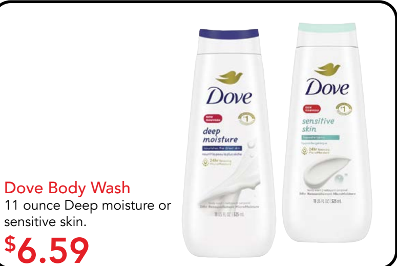
Dove Body Wash 11 ounce Deep moisture or sensitive skin.