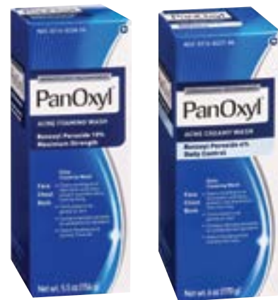
PanOxyl 5.5 ounce Acne Foaming or 6 ounce Acne Creamy Wash.