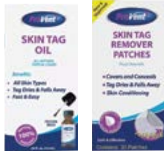
ProVent Skin Tag .34 ounce Oil or 30 count Patches.