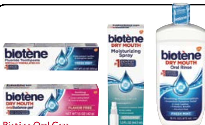
Biotène Oral Care 1 ounce Dry Mouth Oral Balance Gel, 4.3 ounce Fluoride Toothpaste, 1.5 ounce Dry Mouth Moisturizing Spray or 16 ounce Dry Mouth Oral Rinse.