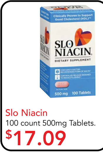
Slo Niacin 100 count 500mg Tablets.