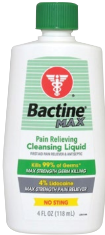
Bactine Max 4 ounce Cleaning Liquid or 5 ounce Cleansing Spray.