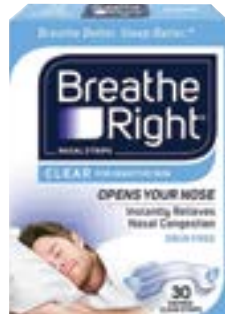
Breathe Right Nasal Strips 26 to 30 count. Clear or tan. Assorted sizes.