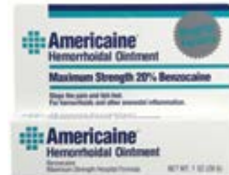
Americaine Hemorrhoidal Ointment 1 ounce Maximum strength.