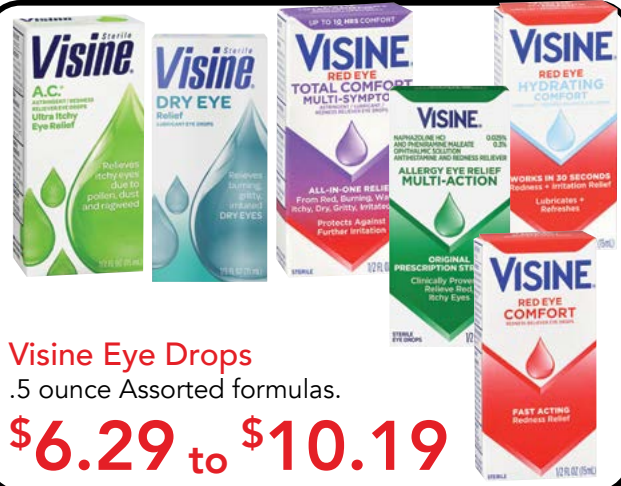
Visine Eye Drops .5 ounce Assorted formulas.