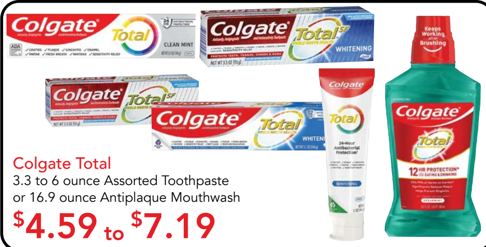
Colgate Total 3.3 to 6 ounce Assorted Toothpaste or 16.9 ounce Antiplaque Mouthwash