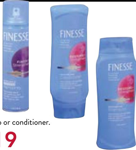
Finesse Hair Care 7 to 13 ounce Hairspray, shampoo or conditioner.