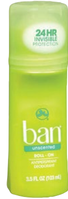
Ban Antiperspirant Deodorant 3.5 ounce Roll-On or 2.5 ounce Invisible Solid.