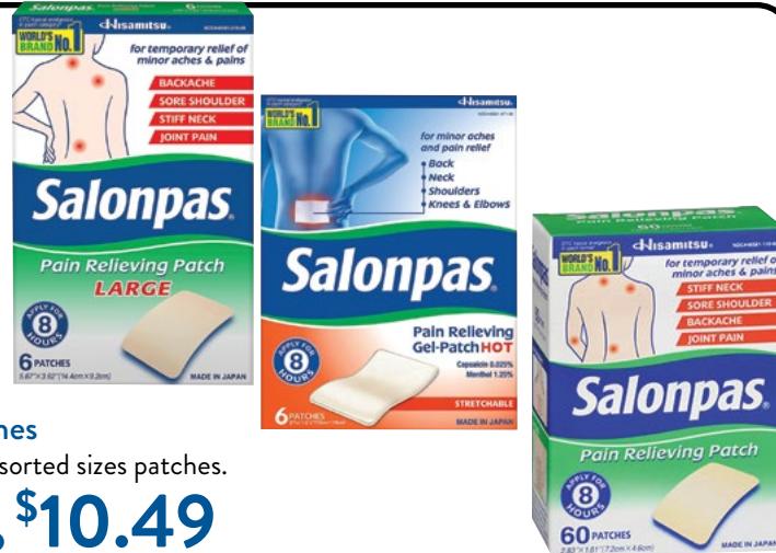
Salonpas Pain Relieving Patches 6 to 60 count. Assorted sizes patches.