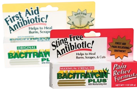
Bacitracin Plus First Aid Antibiotic 1 ounce. Original or maximum strength.