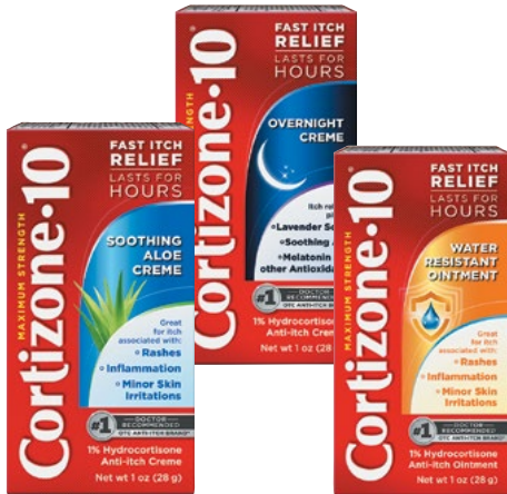
Cortizone•10 1 ounce. Assorted maximum strength creme or ointment.