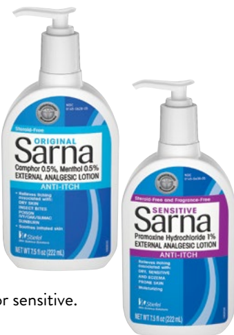
Sarna Anti-Itch Lotion 7.5 ounce. Original or sensitive.