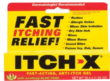
Itch-X Anti-Itch Gel 1.25 ounce. Fast-acting.