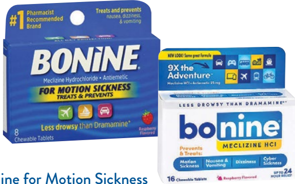
Bonine for Motion Sickness 8 to 16 count. Assorted tablets.