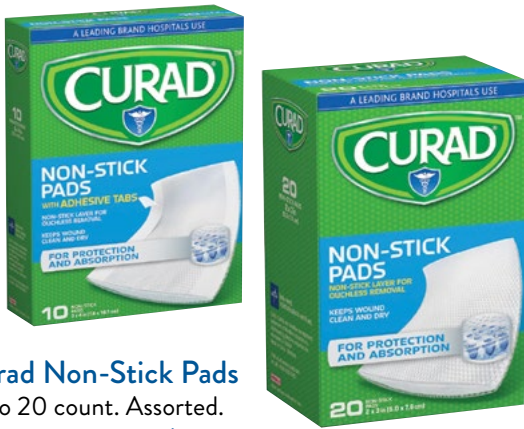
Curad Non-Stick Pads 10 to 20 count. Assorted.